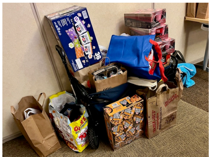
Donations for the Domestic Violence Shelter