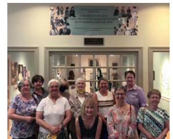
Cumberland County Historical Society "A Woman's Place: The Changing Role of Women in Cumberland County."