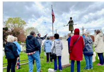
Molly Pitcher Gravesite