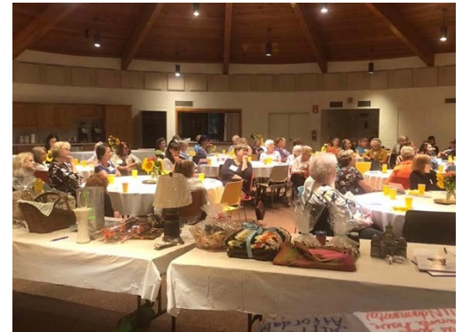
Silent Auction Items