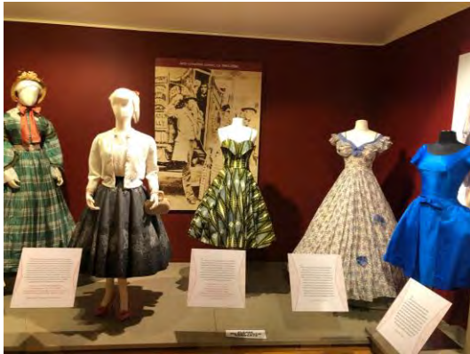
Fashion Archives and Museum of Shippensburg University (Re)Shaping the Body - Exhibit

Several AAUW members visited the Fashion Archives and Museum at Shippensburg University and explored many body-modifying articles invented to answer the eternal question: “How can I make myself more attractive?”