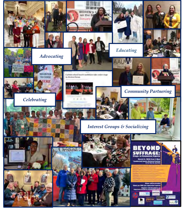
A promotional poster designed by Nancy Sigrist for use at community events.

AAUW - Advancing equity for women and girls through advocacy, education and research