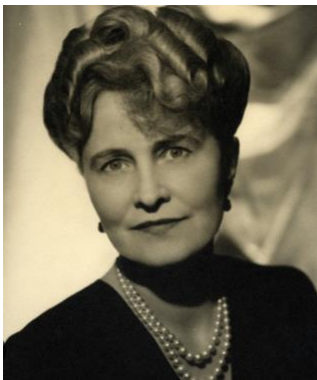
Marjorie Merriweather Post

Plans also include an early dinner stop on the way home which will be at your expense.