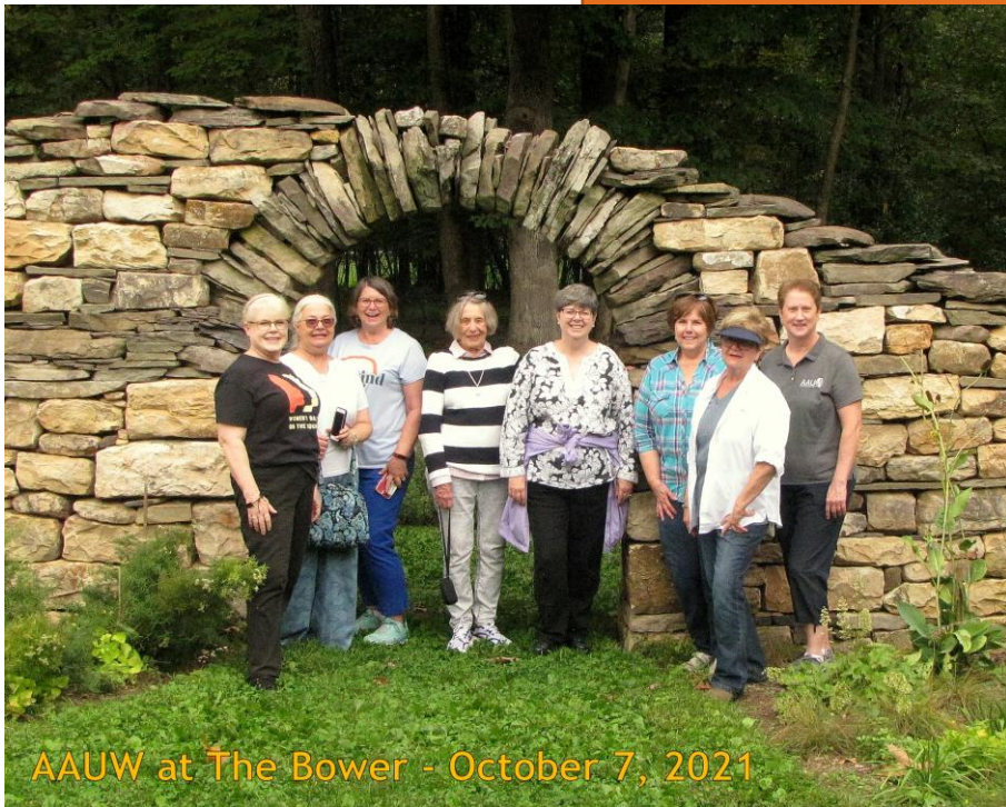
AAUW at The Bower - October 7, 2021