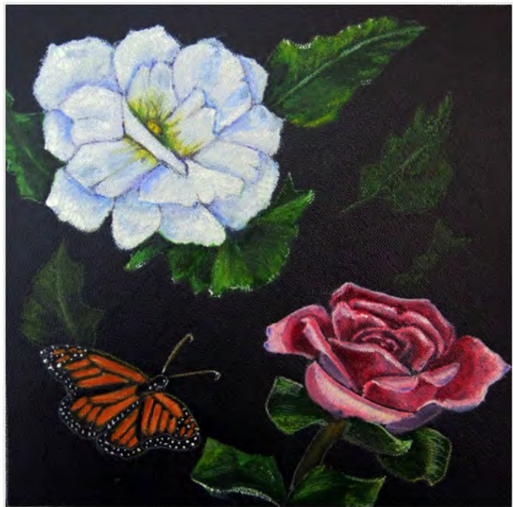
The Butterfly Effect

If so imagine the effect our thoughts and actions have on ours and others' lives?